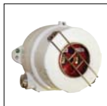
UV and UV/IR Electro-Optical Digital Fire and Flame Detectors