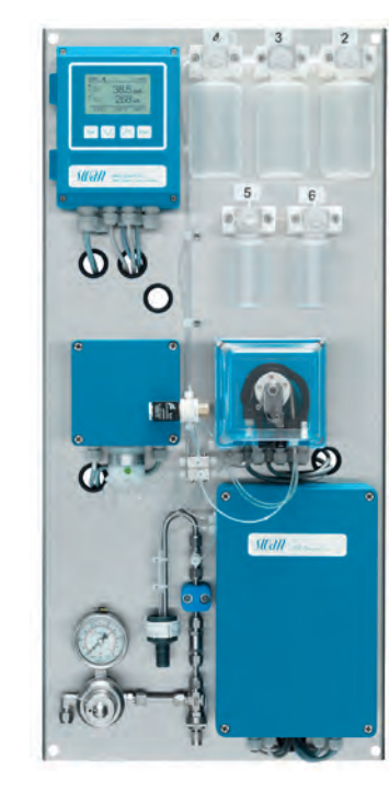
Reagent-free measurement with automatic addition and dilution.