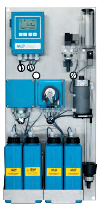
Precision photometer with built-in stream switching.